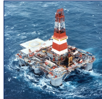
GSF Rig 140